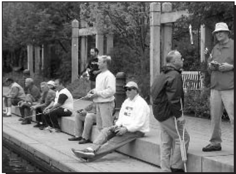
Skippers line the west edge of the center pond in the afternoon.

Morning racing started around 10:00 with lunch at 11:30