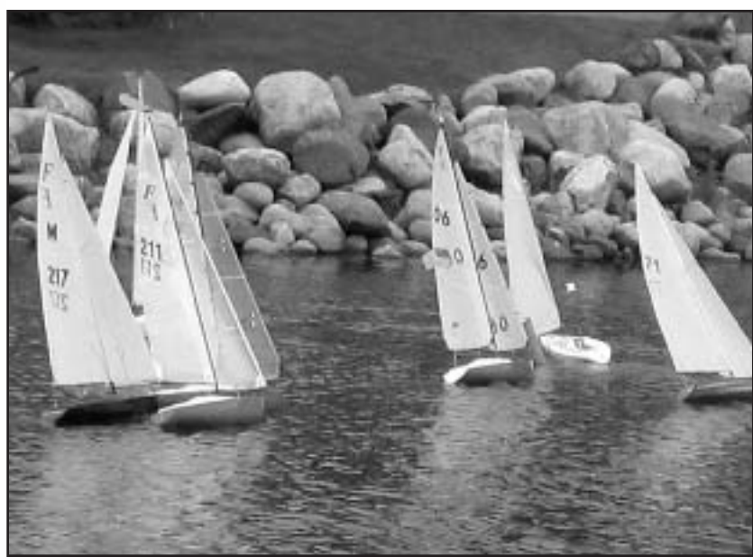
Great turnout! Six of the eleven Fairwinds turning the buoy.

(that's when the air died). Winds came back in the afternoon and racing continued from about 12:30 to 3:00.