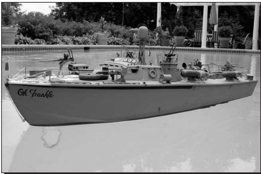
Model of Higgins '78