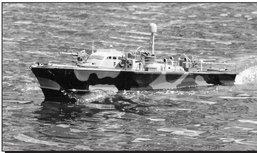
Model of an ELCO '77 at Centennial Lakes

in the English Channel and Mediterranean Sea. Approximately half of the Higgins designed boats served in the Mediterranean Sea and English Channel with the other half serving in the Pacific and Aleutians. Huckins designed boats were assigned to the training squadron, in Melville Rhode Island, the Panama Canal zone and Hawaii.