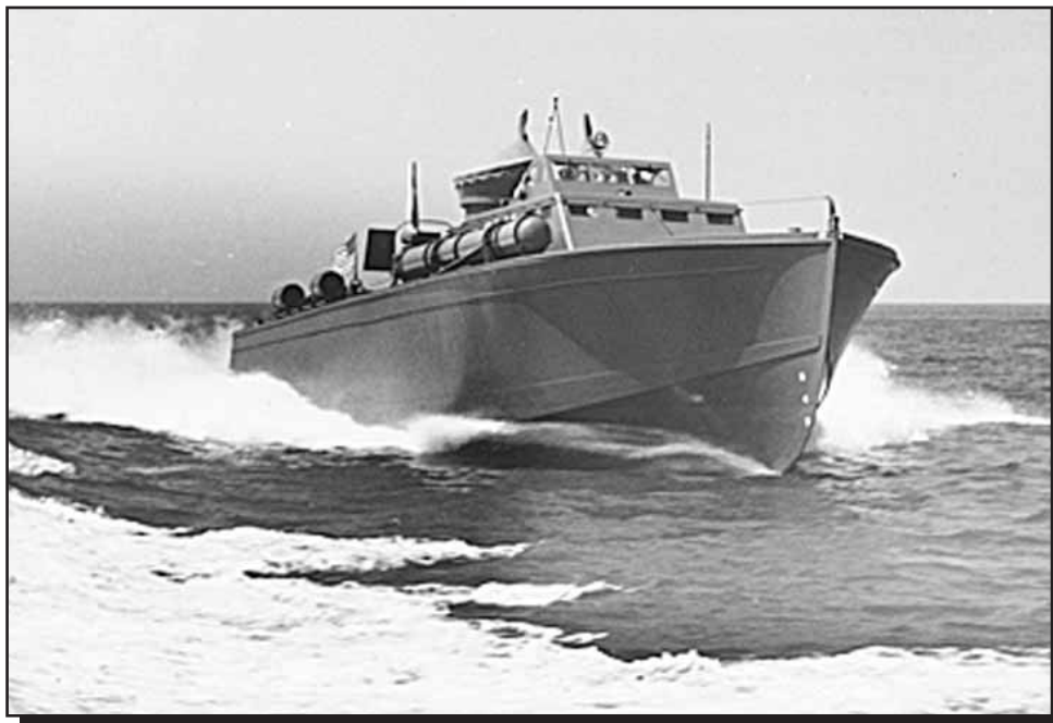
A Huckins '78 during maneuvers

Throughout the Second World War the PT boats would see many transformations enabling the original designs to be modified to fit the mission they would be