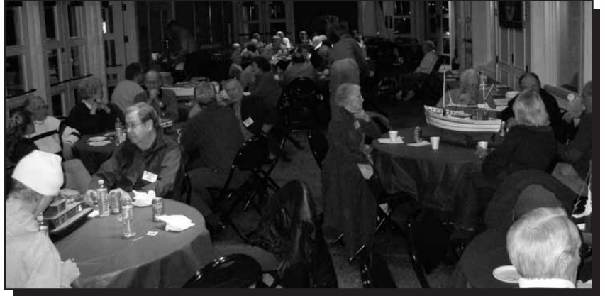
2007 Dry Dock Party Crowd enjoys a Famous Daves dinner.