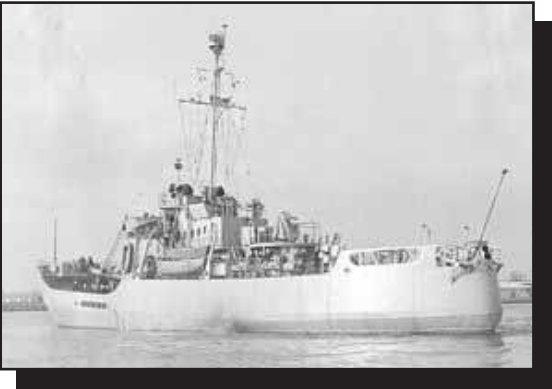
The USCGC Mesquite