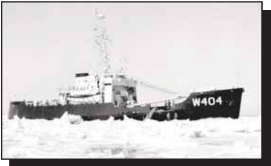
The USCGC Sundew

The Sundew is no longer a Duluth museum ship. What happened to her? Also, the Mesquite is no longer in Charlevoix. Where is she?