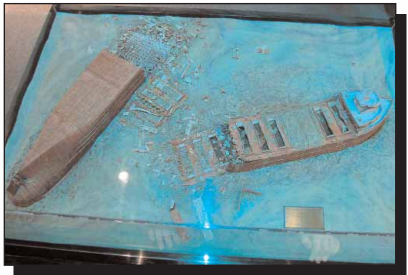
Scale model of the Fitz resting place

Length: 729 feet Height: 39 feet Breadth: 75 feet Weight empty: 13,632 tons Hull: 301 Registry number: US 277437 Christened: June 8, 1958 First voyage: Sept. 24, 1958 Ship Builder: Great Lakes Engineering Works Engine Manufacturer: Westinghouse Electric Corporation Final resting place: Lake Superior, 530ft underwater Sinking: November 10, 1975 with no survivors