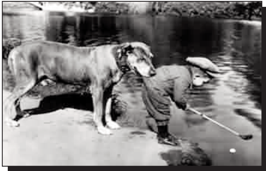
Old Photo - "A Day At The Pond"

Spot putty from automobile stores works great dings, dints and scratches. Goop stays sticky/in some cases can work better