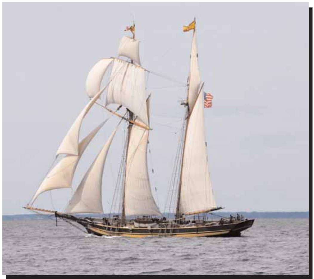
Pride of Baltimore under full sail on Lake Michigan..

Here are some pictures of various tall ships, taken from "before the mast" on Niagara on Lake Michigan and Lake Erie. (continued on page 5)