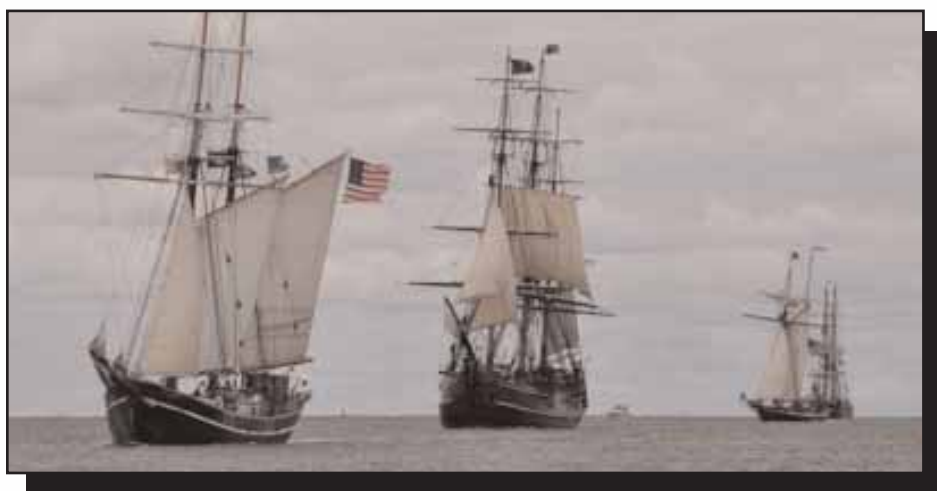
Ships on parade during the Summer 2010 Great Lakes tour