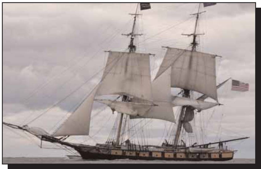
Niagara in some stiff wind..

One of six warships built to regain control of the upper Great Lakes from the British during the War of 1812, the hastily built Niagara was Commodore Oliver Hazard Perry's relief flagship in the Battle of Lake Erie on September 10, 1813. In this pivotal naval battle the entire British squadron of six warships was captured by Perry's nine ship squadron. This victory led to the reopening of American supply lines on the upper Great Lakes.