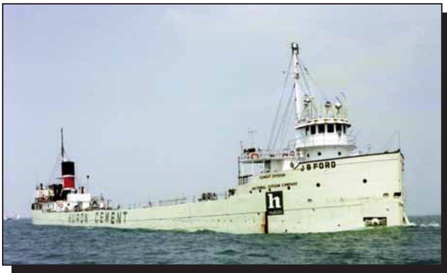
The J.B. Ford originally known as the Edwin F. Holmes in 1904 and the E.C. Collins in 1915. Became the J.B. Ford in 1956.