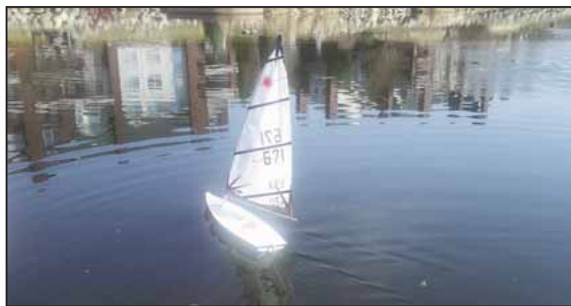
First in the pond, 2:35pm March 14, 2012