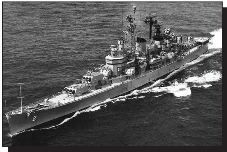
USS Canberra underway near Cuba