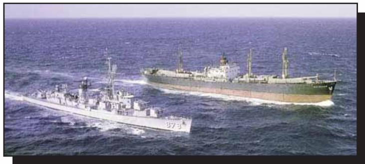
USS Vesole alongside Soviet freighter Polzunov