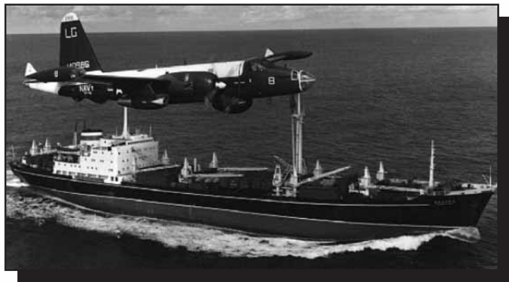
P-2H Neptune flying over Soviet freighter