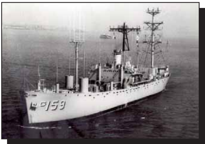
USS Oxford at Guantanamo Bay, Cuba