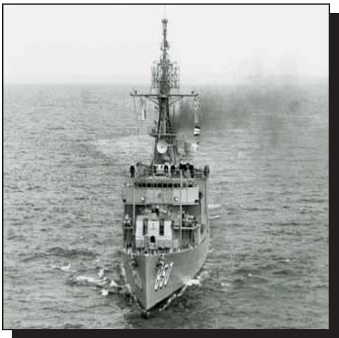
USS Joseph Kennedy in the Cuban blockade

Most of us in the club remember the days that led up to the Cuban Missile Crisis. I found some military photos that were taken during this time during the Cold War in 1962. All photos are from various Naval Archives.