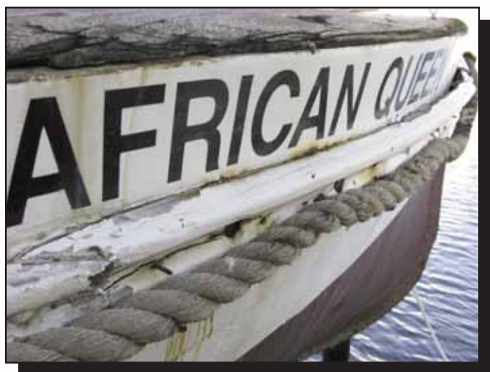
The hull was repaired and reinforced

she was used to transport a mixture of big game hunters, mercenaries and cargo.