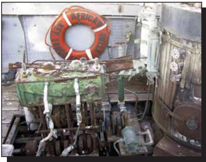
The original boiler had to be replaced