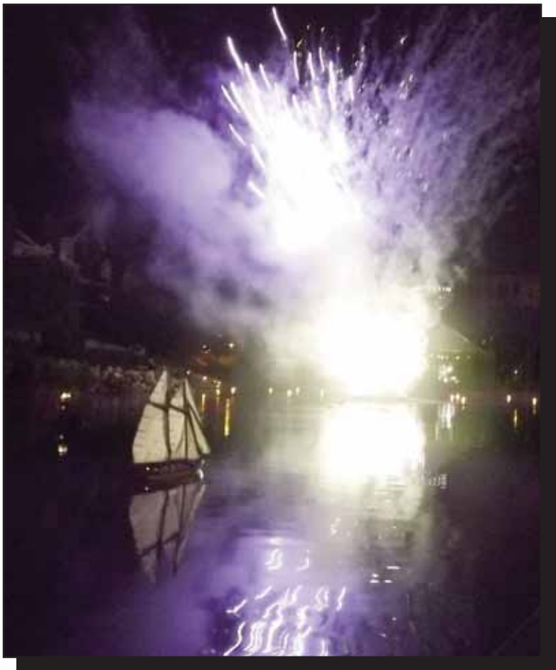
Lighthouse Night