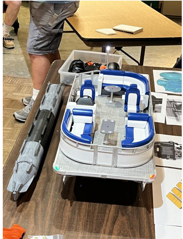
Closer look at the boat and the interior finishings. On the left is a larger pontoon that illustrates the sanded and ready to paint lighter colored pieces, and in the middle a darker colored off the printer section ready for light sanding.