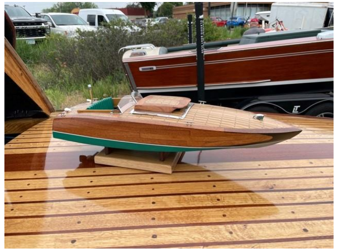
Model of what we have now