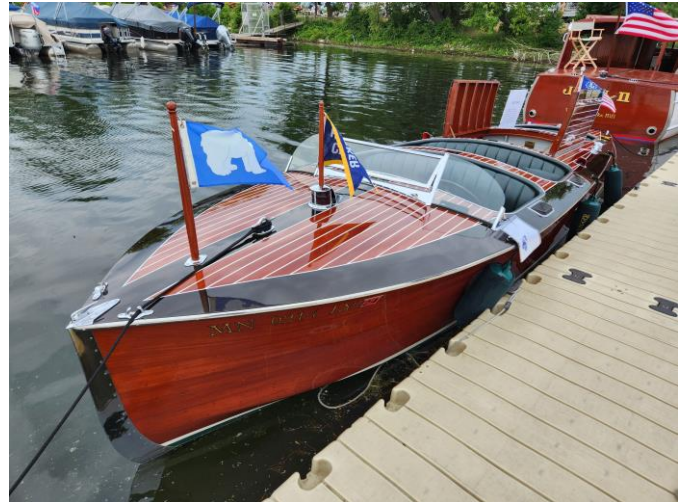
Two on the water