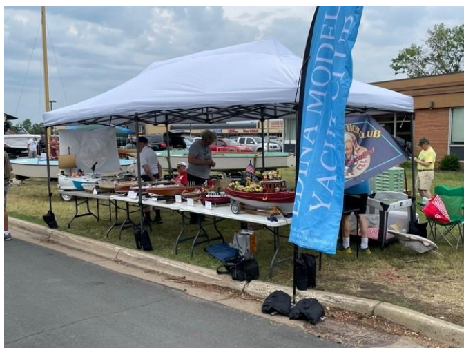
New awning/tent/roof - really nice!!

There were a couple of models for sale at various vendors, and another full scale boat builder had done a scratch built scale version and displayed them together. Everyone thought the new tent was a great upgrade-we even put up half of the included side curtains when we thought we had rain approaching- but that step of preparation was enough to ward off the rain, so they came back off - Rob Segal