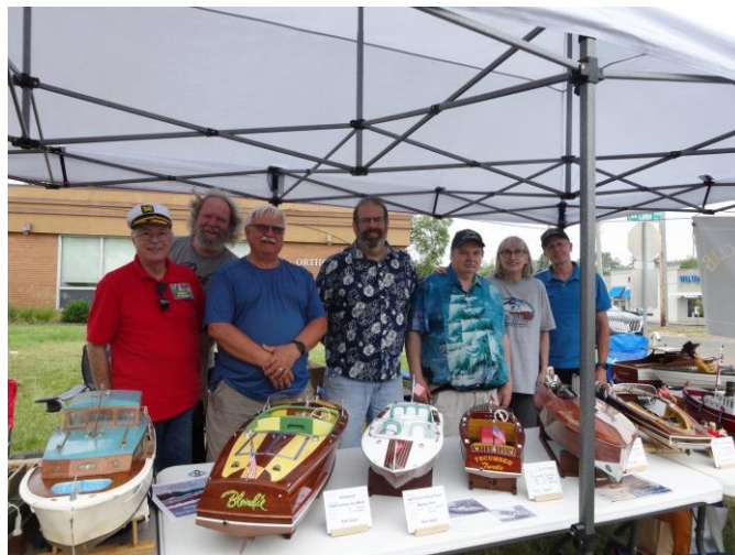
Representing the good 'ol EMYC