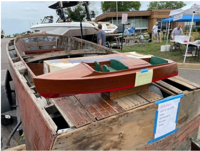
Model of what we hope to have some day