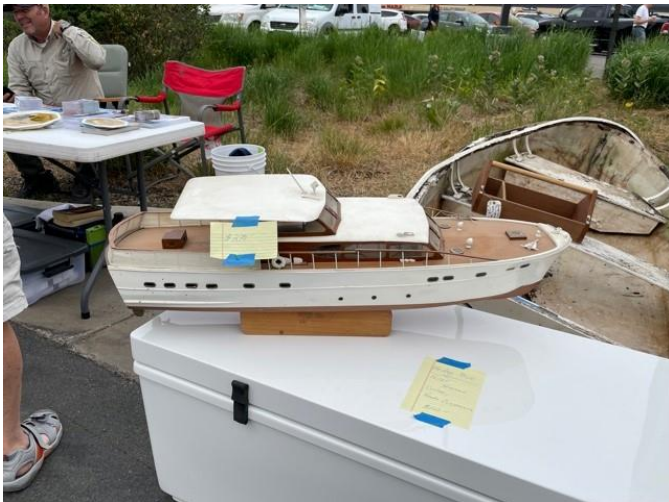
Model for sale