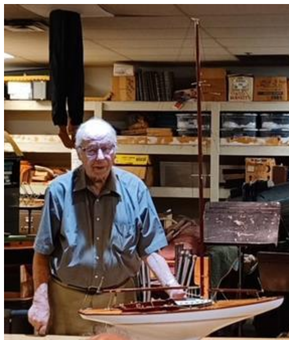
At the meeting!