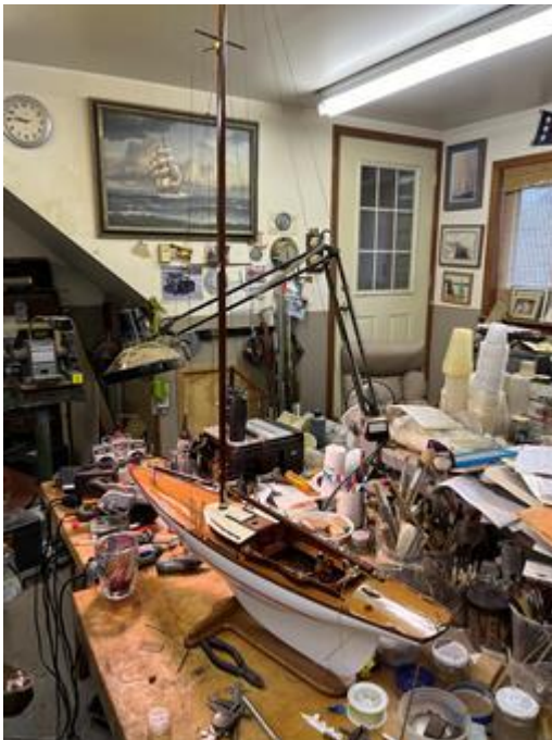
In the shop....

Next Paul Olsen brought a beautiful smaller version of his classic Marblehead boat. This one is 36 inches in length and is a static display with additional detail applied for display only purposes. The full size Marblehead is 50 inches in length and has complete RC electronics.