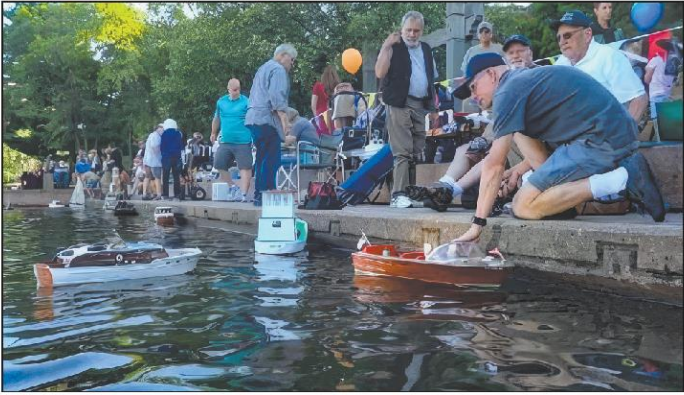
Members of the Model Yacht Club place their scaled miniatures into the Centennial Lakes Center Pond in Edina for Lighthouse Night.