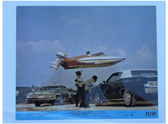
Left is a 1975 Rebel Custom (Merc 1150) Right is a 1974 Glastron GT 150 (Merc 850)